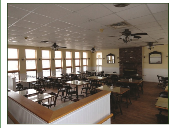
Main Dining Room with Fireplace

Full complement of plates, bowls, utensils and glasses are all here. Sturdy tables and chairs are all arranged in the small and main dining rooms awaiting your diners. The wait staff will love the POS system for putting orders into the kitchen. There are two entrances into the kitchen-one has a double swing door.