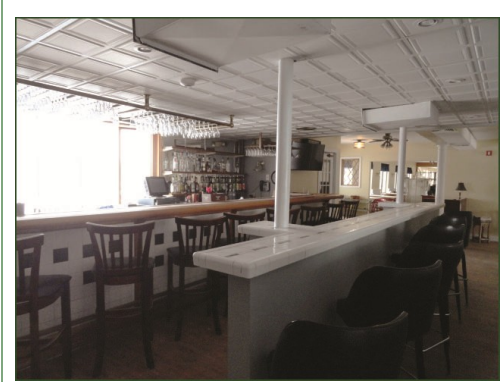
Lounge/Bar with seating for 25

Customers will love sitting at the bar while watching all the boats pass by. Two large TV's so games can be seen from anywhere in the bar. Eight beer taps with beer keg walk-in, 2 beer coolers, wine refrigerator, mini refrigerator, glass/mug cooler, sinks and automatic glass washer. A lockable walk-in liquor closet is located right next to the bar.