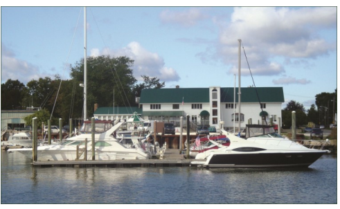
View of Restaurant from the bay